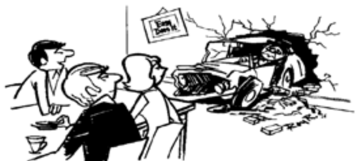
"You've come to the right place, fella."