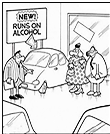
What a coincidence- so does he!

Almeria Group/Last Tuesday @ 7:30pm Coral Gables Group/Last Monday @ 8:00pm Grupo Central/Last Sunday @ 1:00pm Good Morning Group/Last Friday @ 10:00am Happy 1060 Group/Last Sunday @ 10:45am Homestead Group/Last Thursday @ 8:30pm Key Biscayne Group/Last Friday @ 8:30pm Killian Pines Group/Last Friday @ 8:00pm Lincoln Road YP/Last Sunday @ 7:00pm Little River Group/Last Wednesday @ 8:30pm Miami Springs Group/Last Monday @ 7:30pm Miami Young People/Last Saturday @ 8:30pm North Miami Group/Last Friday @ 8:30pm Palmetto Bay Group/Last Saturday @ 5:30pm Plymouth Group/Last Wednesday @ 7:00pm Primary Purpose/Last Saturday @ 8:30pm Sabal Palm Group/Last Sunday @ 7:00pm Shamrock Group/Last Tuesday @ 8:30pm Sober Way Out/Last Friday @ 8:30pm Something Happens/Last Saturday @ 9:00am South Dade Group/Last Friday @ 8:30pm South Dixie Group/Last Saturday @ 7:30pm Sunset Group/Last Friday @ 7:30pm West Miami Group/Last Friday @ 8:30pm We Stopped in Time/Last Monday Young, Sober and Free/Last Sunday